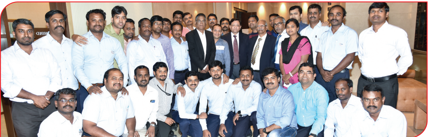
Visteon Team Members with NIQR National Executive Members