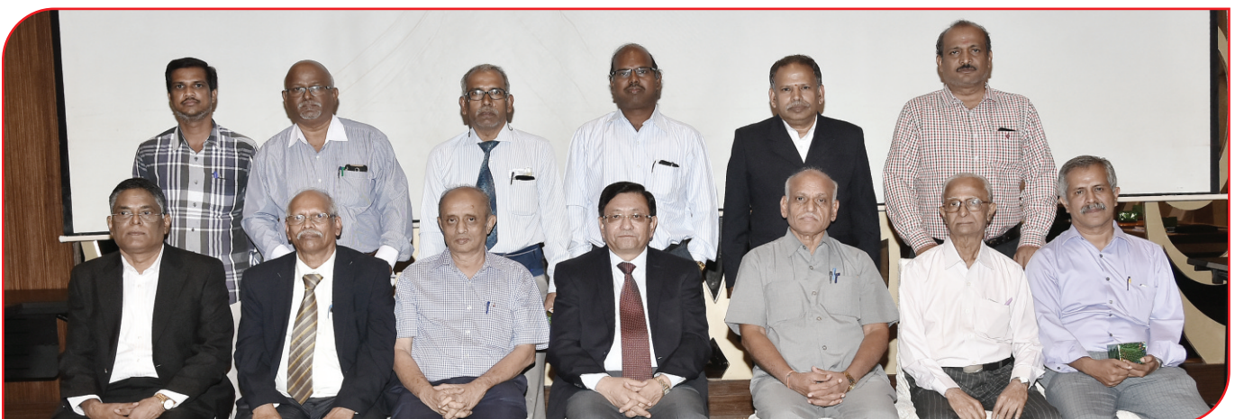
NIQR Team Members