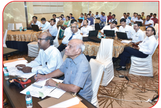
A view of the participants