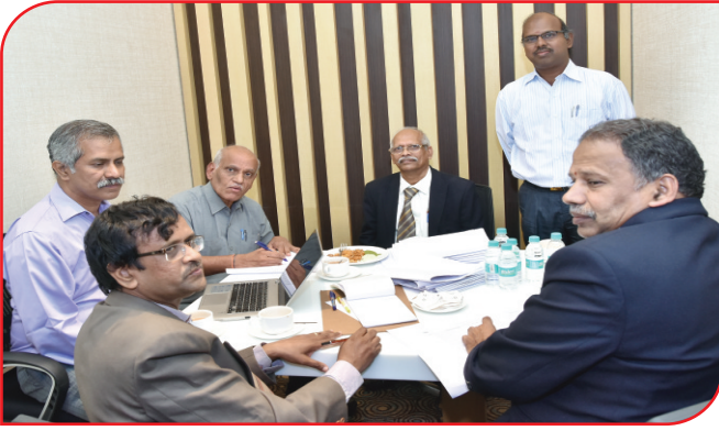
Compilation of results by the Juries